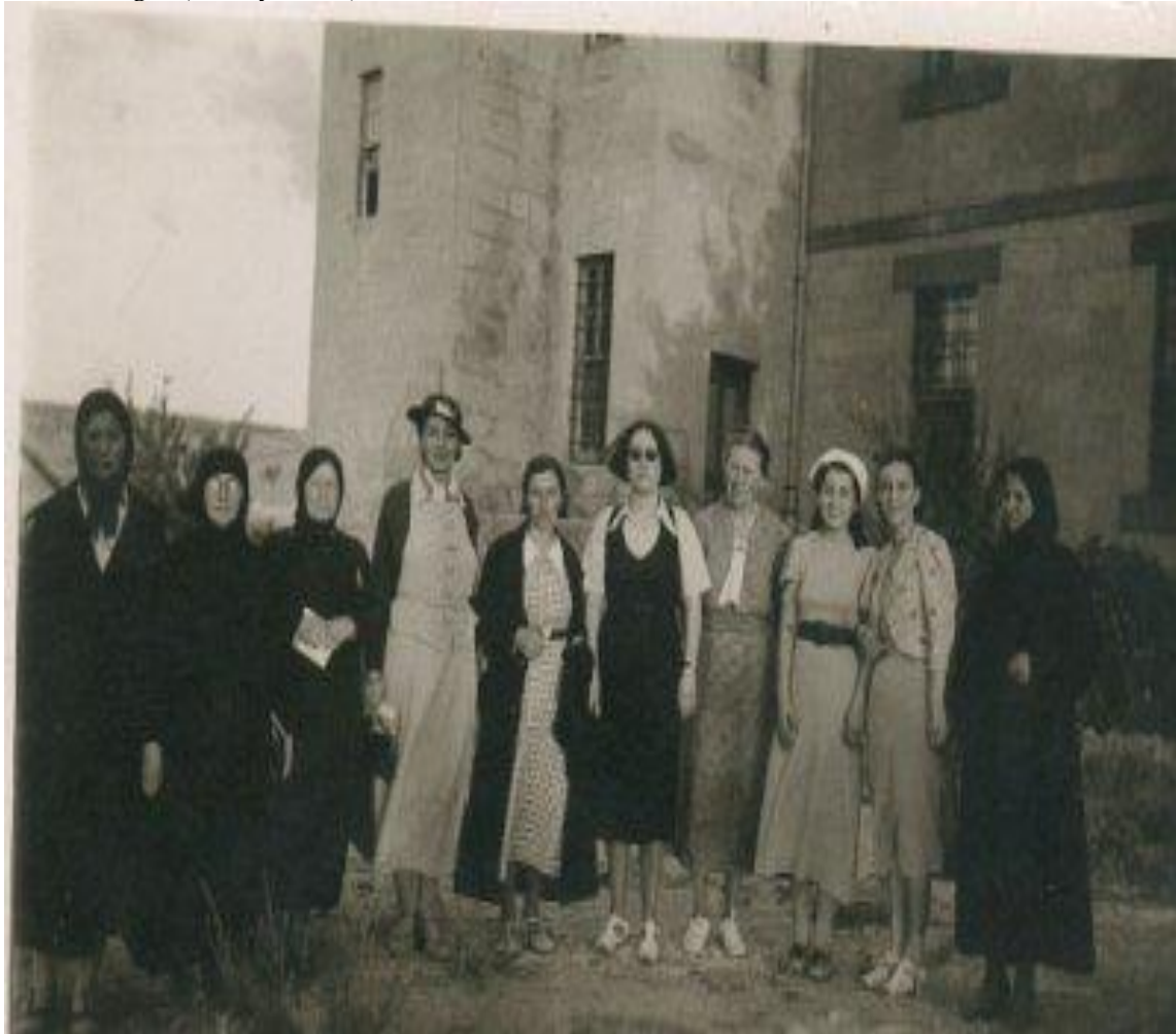
Figure: In this photo taken in 1909 by Mrs. Gertrude Bell, a panoramic view of Talas and the garden of Talas American Hospital are seen.

As it is seen, the hospital was being used together with the school. The hospital's 1930 report gives detailed information about the subordinates of the hospital, treatments provided and the budget (Özsoy, 1996).