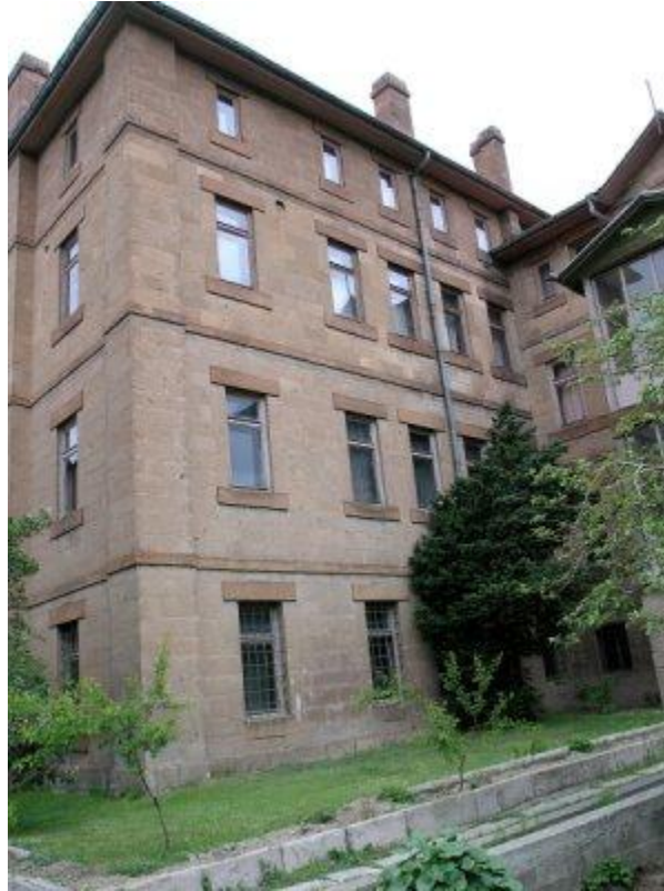
Figure: Kayseri American College

These expressions indicate that lessons were in English; social activities were organized for students and the school was a preferred one. It strikes us that the school was a successful one with its modern educational practices. A typical day at school was as follows: