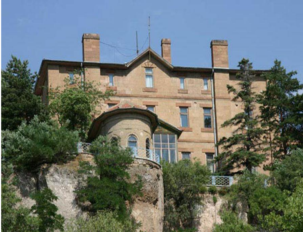
Figure: Kayseri American College