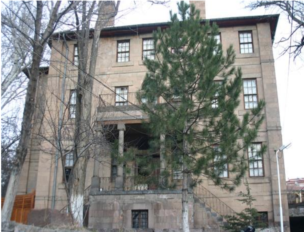
Figure: Talas American Hospital ( http://www.talas.bel.tr/resimgalerisi/pages/amerikanhastanesi.htm )