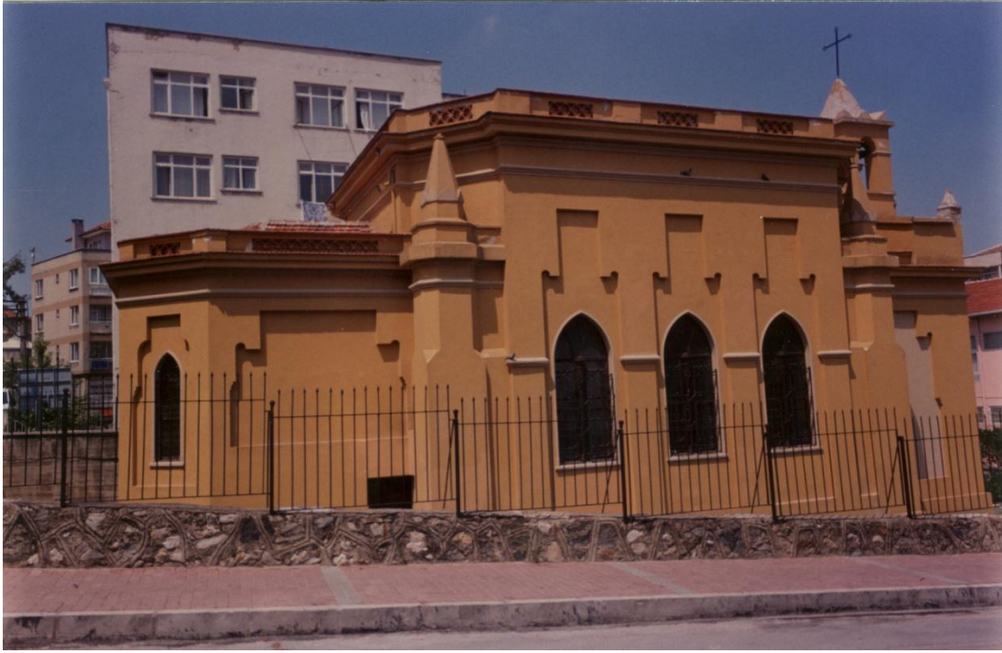
Photo: A Current Photo of the Bursa Prot 1