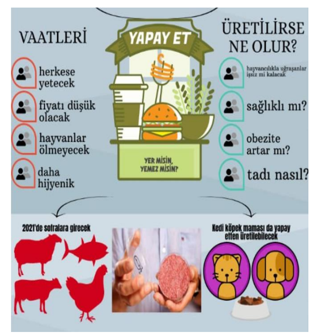
Figure 2. A part from an infographic